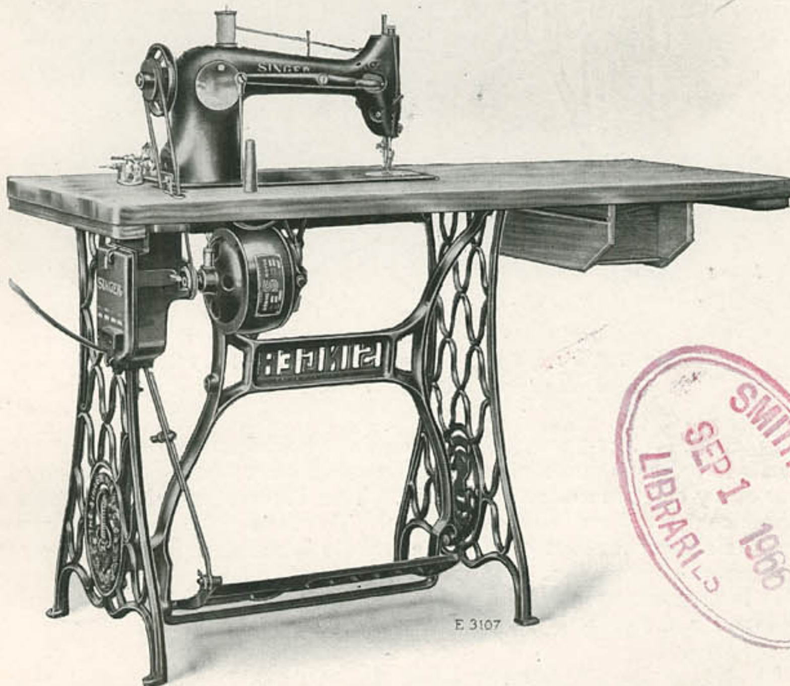
Machine No. 31-15 on Table No. 5268 and Stand No. 25279 Equipped with Singer Motor SD-5

This machine is used in the manufacture of a wide variety of articles as shown on page 3. It has one needle and one shuttle and makes the lock stitch.