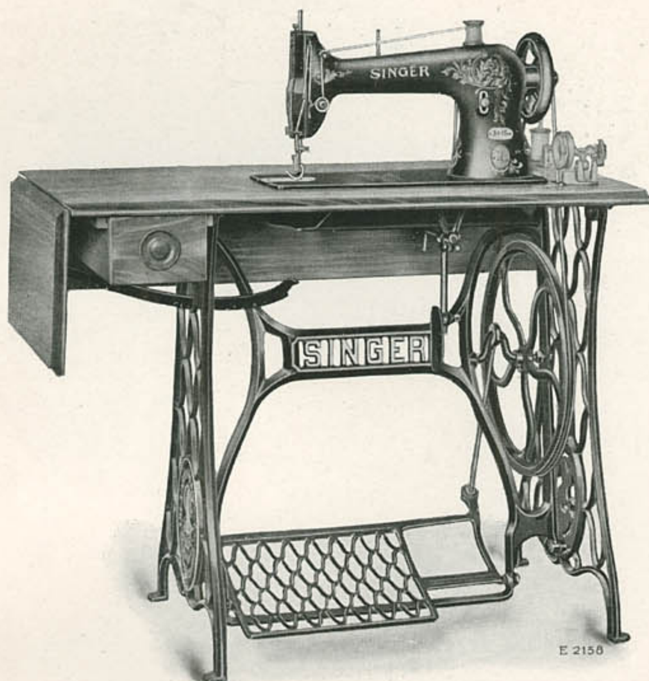
Machine No. 31-15 on Table No. 5412 and Stand No. 25265 For Foot Power

The outfit shown above is very convenient for tailoring, etc., affording ample room for handling garments of large size. With the back leaf and side leaf raised into position the table is 25\frac{1}{2} inches wide by 47\frac{1}{2} inches long.