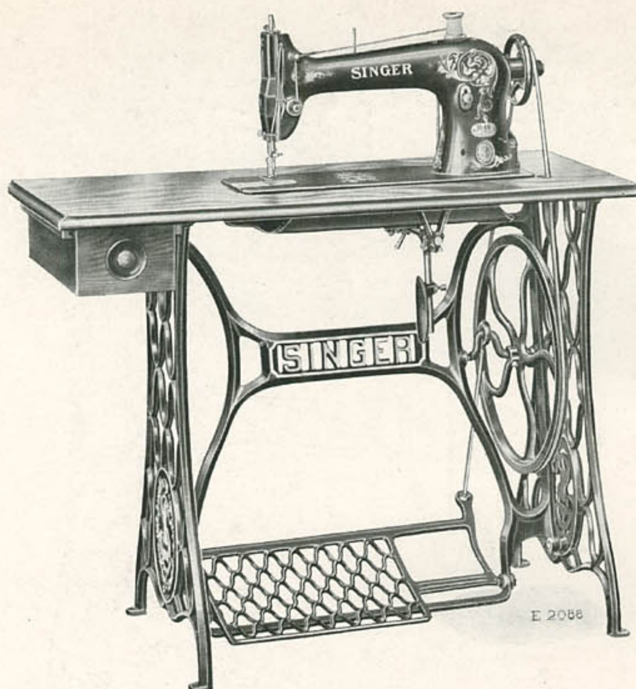
Machine No. 31-15 on Table No. 5411 and Stand No. 25265 For Foot Power

The machine is also sent out with table and stand as illustrated above. This equipment is popular in the manufacture of articles which are smaller in size. Table No. 5411, shown above, measures 18 inches wide by 36½ inches long.