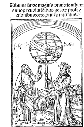
Frontispiece from Abu-Ma'shar's De magnis coniunctionibus (Venice, 1515)

isagogicus in editions from 1485, 1491, 1502, 1503, and 1521 (all from Venice); Averroës (or Ibn Rushd, 1126-1198), the major Islamic philosopher, and his commentaries on Aristotle's Libri quatuor de coelo et mundo (Leiden, 1542); and several others. In the West, a key astronomical concern was finding the date of the Paschal Full Moon in order to determine when Easter will occur. Although this did not require the complexities of Greek astronomy, it did ensure that astronomy would survive as an important discipline during medieval times, even though the writings of the ancient astronomers were not available in either their original Greek or in Latin translations. Many original works of the early Middle Ages were not of great use to astronomers, although they did contain some interesting ideas. Martianus Capella's (fl. 400) allegorical work about a heavenly marriage, De nuptiis Philologiae et Mercurii , mentioned the possibility that Mercury and Venus orbited the Sun, which in turn orbited the Earth. Copernicus noted this theory in his great work to help lend credence to his idea that the Earth revolved around the Sun. The Dibner Library has two editions of the Capellan work from 1499