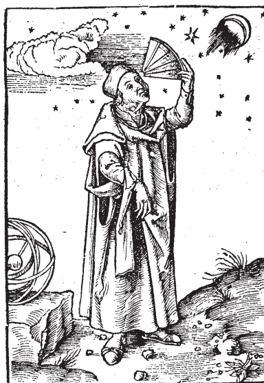
Woodcut depiction of Ptolemy using an astronomical quadrant, from his Geographiae (Basel, 1552)

Ptolemy (fl. AD 127-145), an astronomer from Alexandria, provided a grand synthesis of Greek mathematical astronomy in a