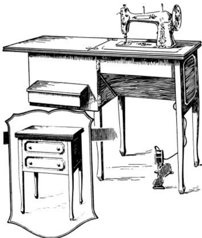
Figure 205.—THIS STANDARD SEWING MACHINE of 1922 operated electrically. A neat console style evolves when the machine is closed. This style forecast the design of cabinets for several decades to come. (Smithsonian photo 74-2102.)