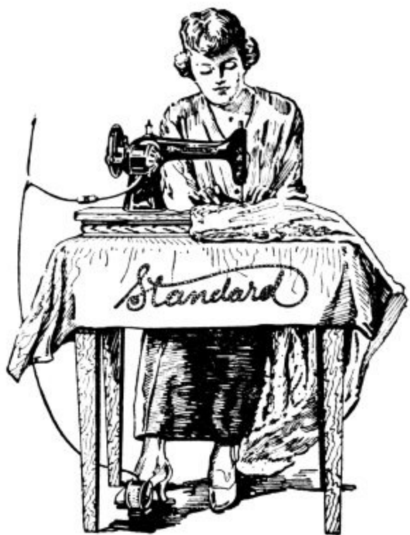
Figure 204.—STANDARD SEWING MACHINE with an electric motor as it appeared in an advertisement in the March 1922 issue of the Sewing Machine Times . (Smithsonian photo 74-2121.)