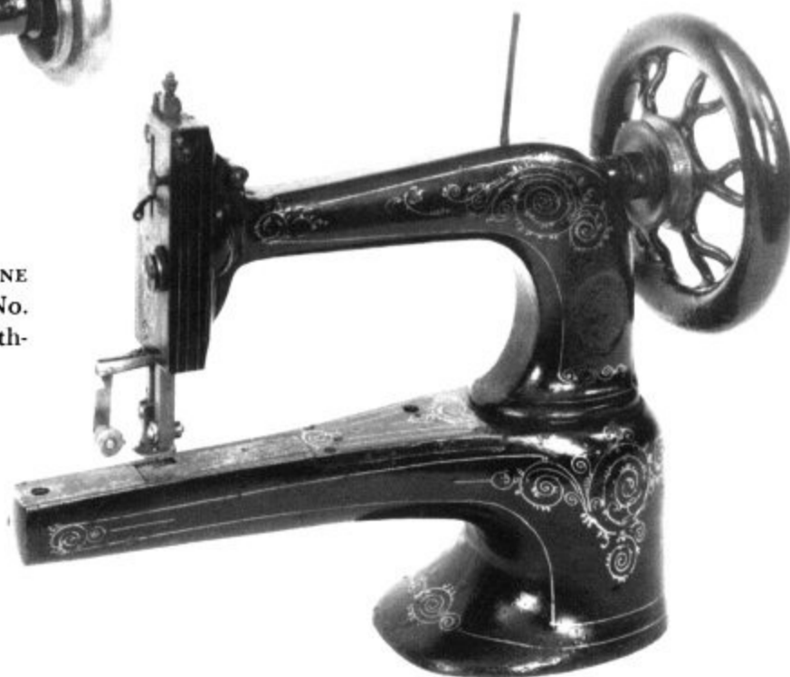
Figure 210.—FACTORY MACHINE for stitching stays in corsets, 1877. Patent No. 192,568 was issued to E. Corbett and C. F. Harlow.