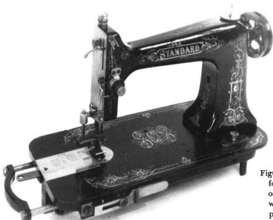
Figure 214.—STANDARD FACTORY MACHINE of 1892 for parallel rows of stitching, most widely used on men's shirts, for which Patent No. 479,369 was issued to Ferdinand Kern.