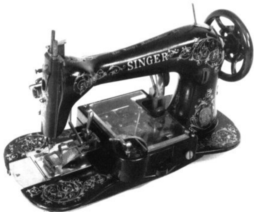
Figure 212.—SINGER FACTORY MACHINE of 1889 for making buttonholes has a device for cutting the buttonhole. Added in an 1890 patent is a mechanism for sewing on 4-eyed buttons for which Patent No. 425,422 was issued to J. P. Hallenbeck.